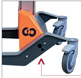
Charging socket and on/off switch

The chassis houses the charging socket and the on/off switch. It is very simple to charge the battery and switch the lifter on and off.